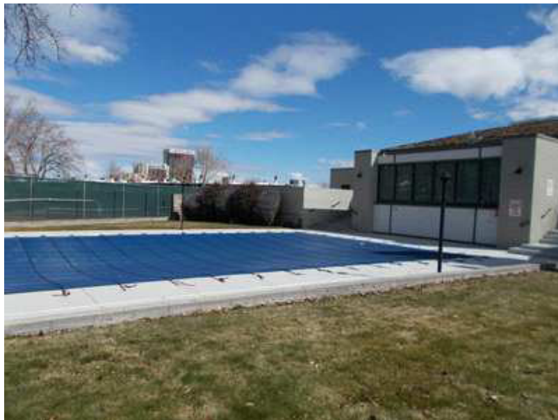
The Pool Components include the Wrought Iron Fencing, Pool Concrete Deck, Pool Re-Surface, Pool Heater, Pool Pump and Pool Filter Replacement. The Useful Life of each component is an estimation only.