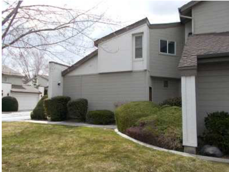
The Exterior Painting is done in phases, every 7 years, as needed.