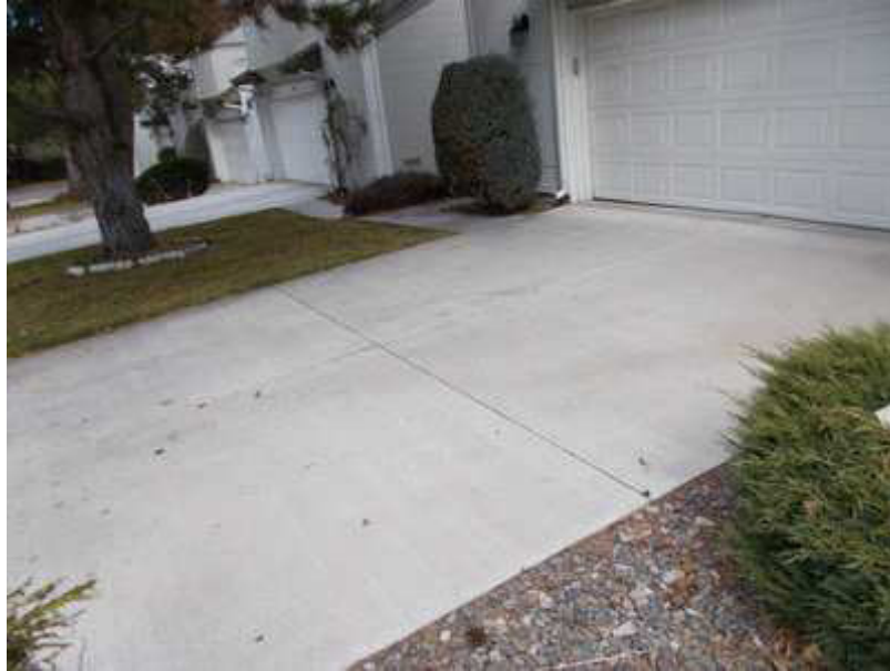
The Driveways are maintained by the Homeowners Association. Replacement is included in the Common Area Concrete Allowance.