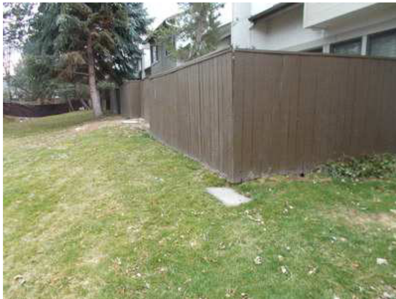
The Board of Directors may want to consider moving the grass away from the Patio Fencing so that water from the sprinklers does not damage the fencing.