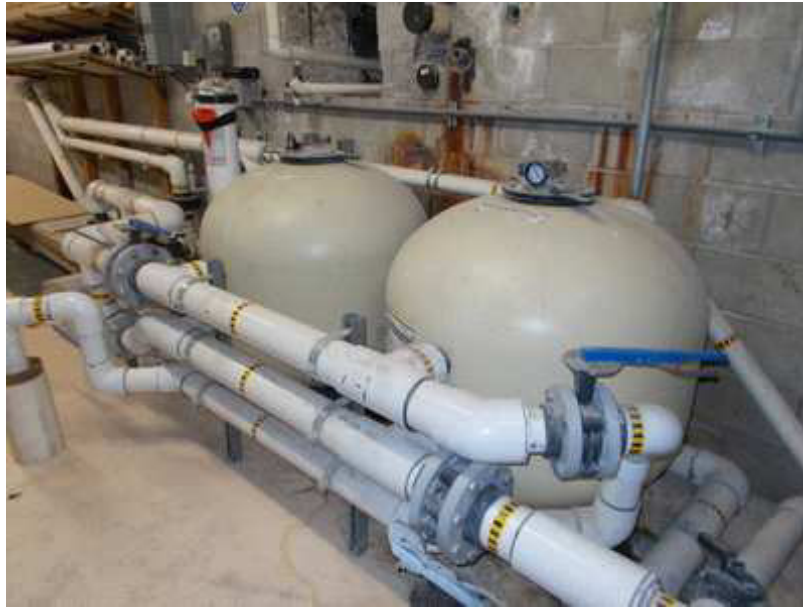
The Pool Equipment and Plumbing Systems were completely replaced and reconstructed. Future Replacement has been included in the Study.