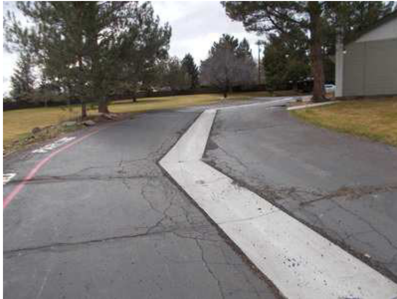
Removal and Reconstruction of all Asphalt Roads and Concrete Drainage Swales have been done in phases.