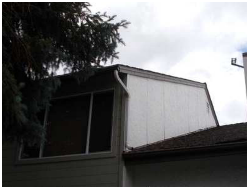
Rain Gutters are maintained by the Individual Homeowners and have not been included in the Study.