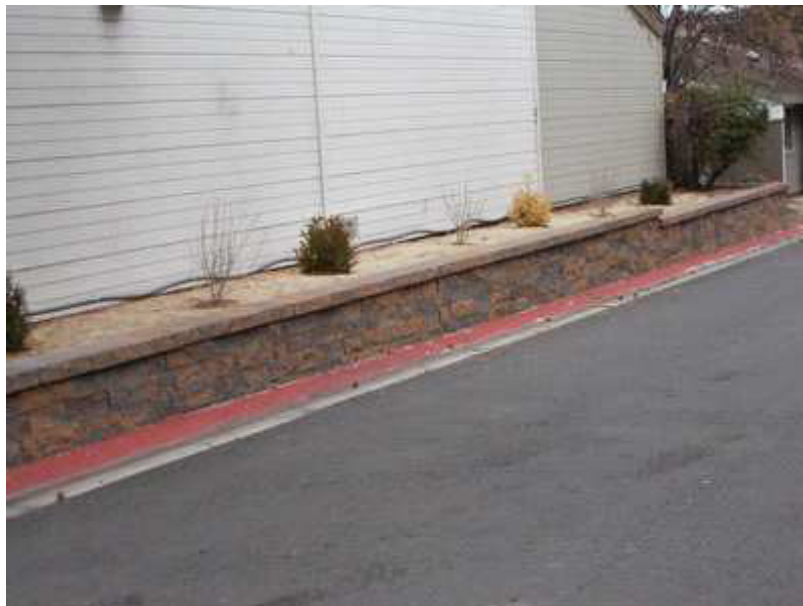
Retaining Walls were replaced in 2018, future replacement has been included in the Study.