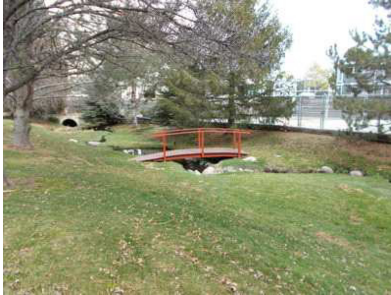
The Bridge was re-built in 2018. Future replacement has been included in the Study.