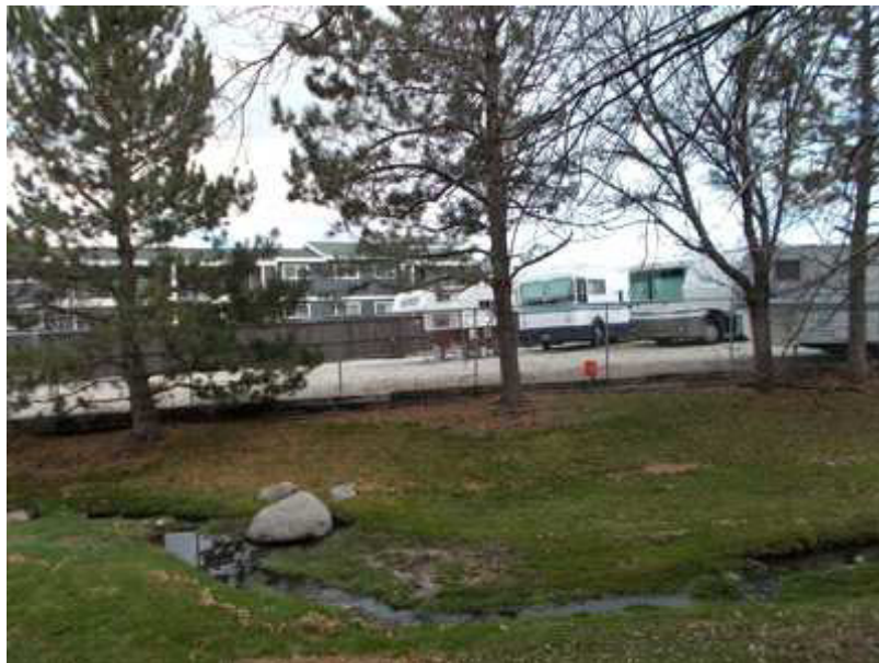
The Drainage Ditch is maintained through the Operating Budget and has not been included in the Study.