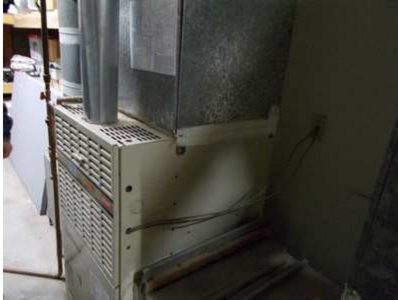
There are 2 HVAC Units for the Clubhouse. Maintenance and Replacement have been included in the Study.