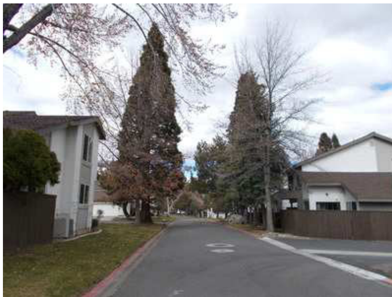
The Asphalt Road Maintenance Schedule includes the Surface Maintenance Treatment, Overlay and Crack Seal. This Schedule is an estimation only.