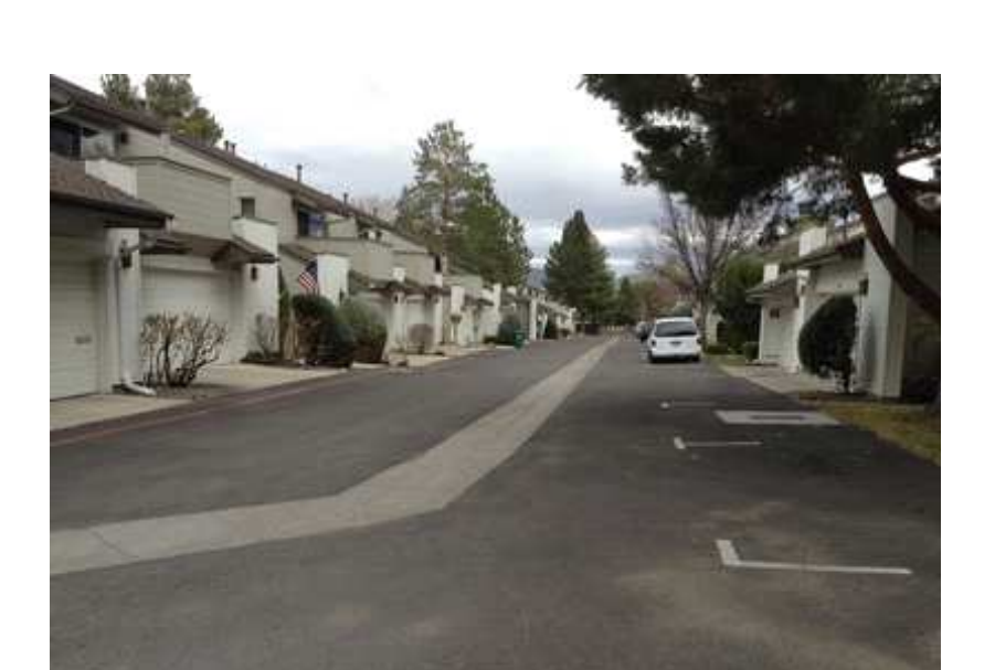
The Asphalt Removal and Replacement and Concrete Drainage Swale Replacement has been scheduled in Phases to be done within the next 3 years. Roads that are scheduled for an Overlay will not receive Slurry Seal or Maintenance until the Overlay is completed. Concrete Curb/Gutters are replaced when the Roads have the Overlay.