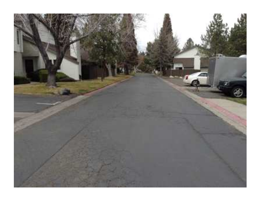
Roads and Parking