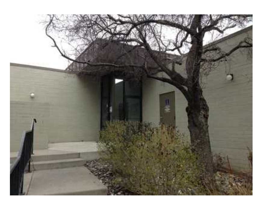
All Clubhouse Exterior Components have been included in the Study, including Painting, Roof and Windows and Door Replacement. The Interior Painting and Carpet Replacement has been included in the Study. Furniture Replacement and Restroom Remodel are also included.