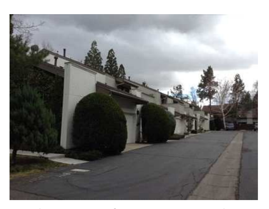
The Exterior of Homes is the HOA Responsibility. A Roofing and Painting Schedule has been included in the Study. Garage Doors are the Individual Homeowner Responsibility. Concrete Driveways are maintained by the Association. Replacement of Concrete Driveways is scheduled to be done as needed. The Association is well maintained and in overall good condition.