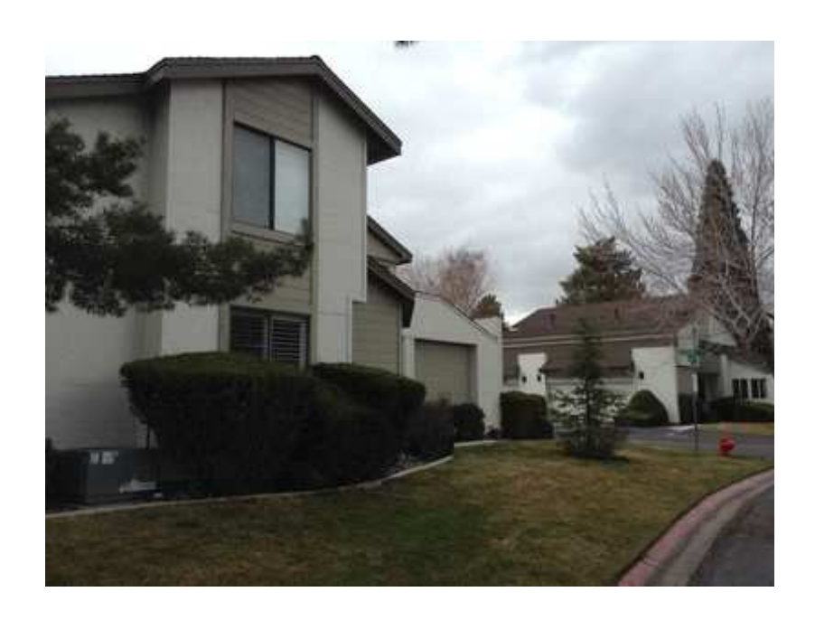
Exterior of Homes