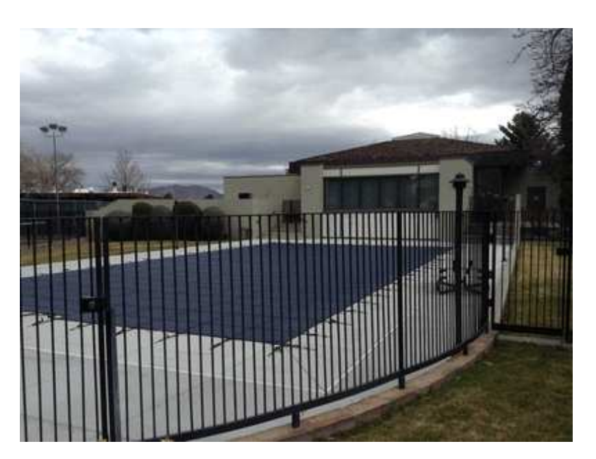
The Pool was completely rebuilt in 2014. All Pool Components and new estimated useful lives have been included in this Study.